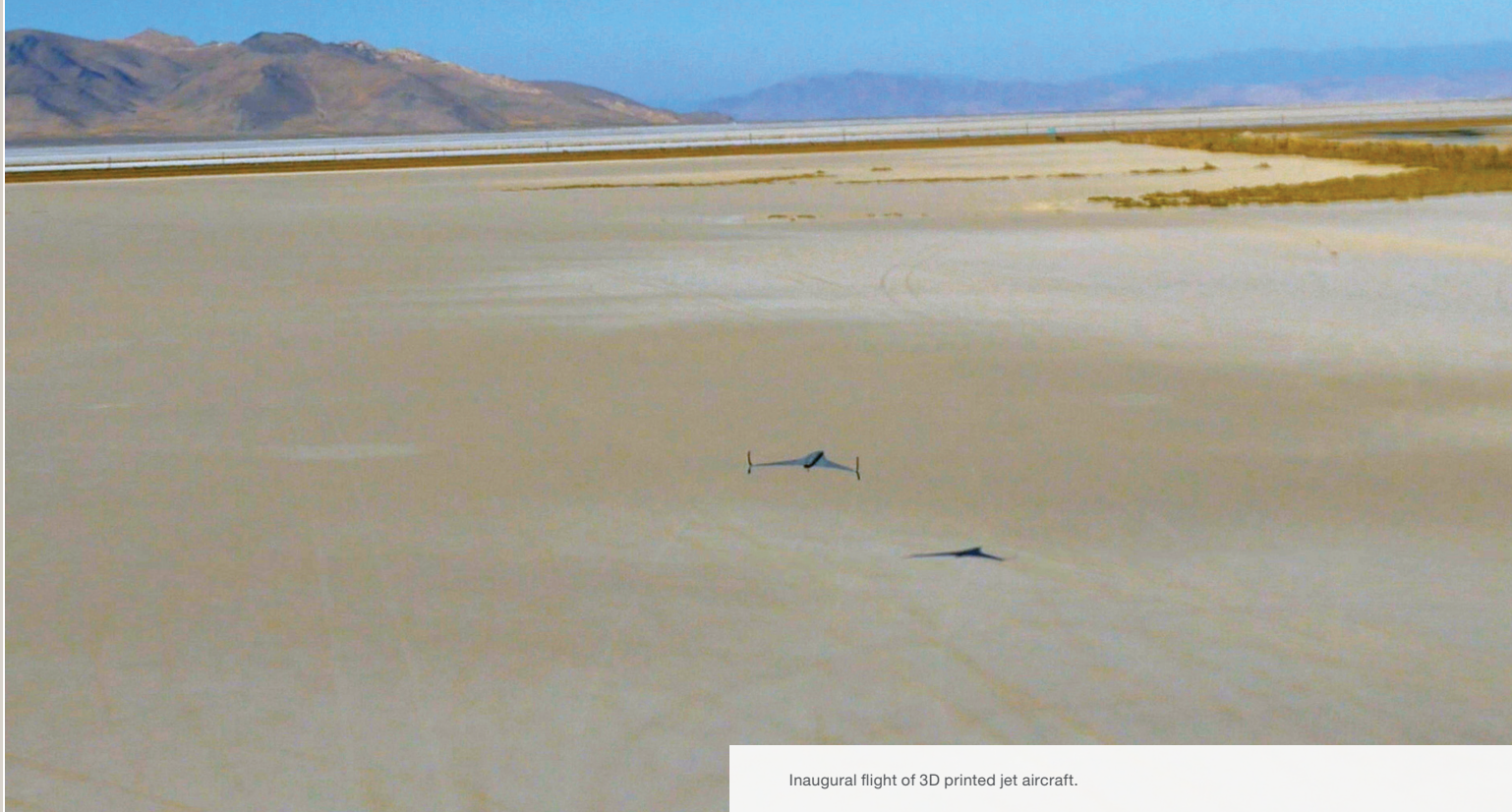
Inaugural flight of 3D printed jet aircraft.