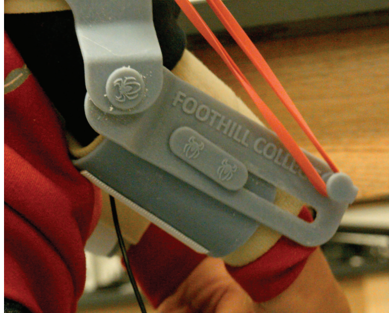
Students can easily scale and reprint the device to accommodate Noel's growth.

3D printing empowers students to easily scale components to fit, and to affordably reprint them to accommodate Noel's growth and development. Support material is removed simply with water. The flexibility of 3D printing also gave students an opportunity to personalize the device, making it