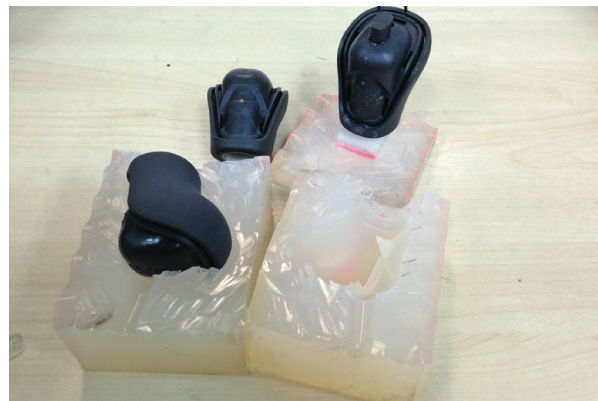
Solidify 3D printed a master part to create these silicon rubber molds for their automotive client.