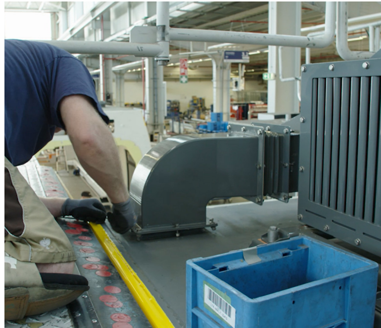
The final custom air vent system, 3D printed in ULTEM™ 9085 resin.

The F900's build capacity is big enough for Bombardier Transportation to produce large vehicle components or print several different parts on the same build tray. This gives flexibility to on-demand production and delivers an increased scope for large-size parts like the air duct.