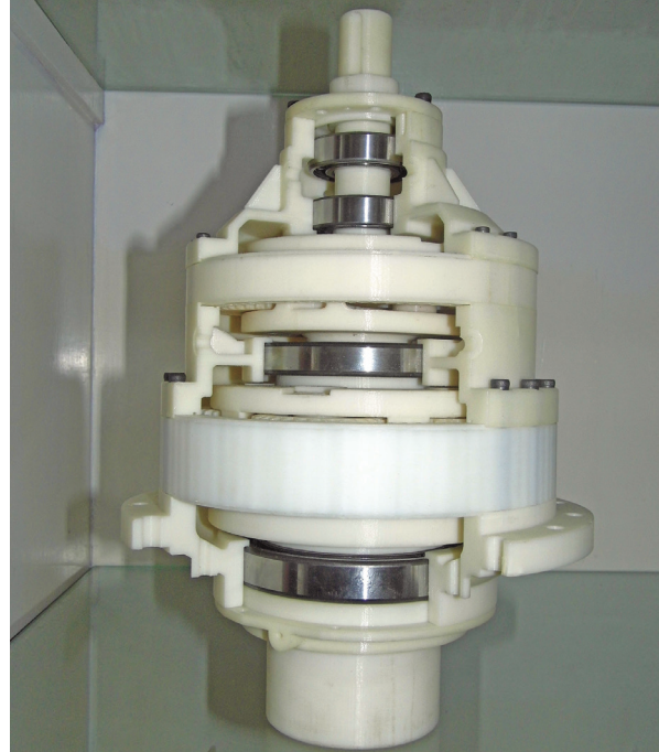
Premium’s engineers create complex designs using FDM Technology.

Premium invested in a 3D printer based on FDM® Technology to produce prototypes for its entire range of products and components in house. Engineers could create the modular planetary unit in 3D CAD and produce the prototype in one print, saving time and resources while keeping the designs confidential. The same modular planetary unit that once took up to six weeks took Mukhopadhyay and his team only a few days. And any necessary design iterations were edited easily in CAD and 3D printed for form, fit and functional tests.